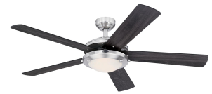
Reversible Wengue Finish Blades